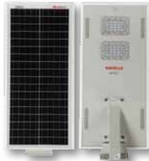
15 W / 18 W / 20 W