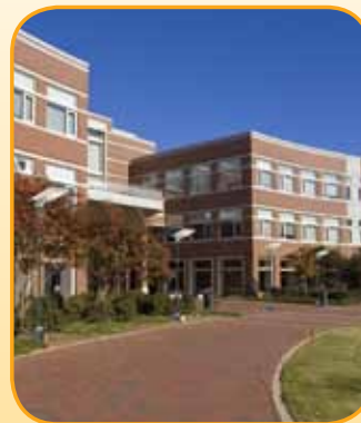
School | College | University