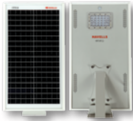
7 W / 9 W / 12 W