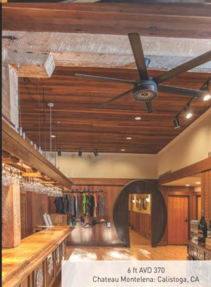
6 ft AVD 370 Chateau Montelena: Calistoga, CA