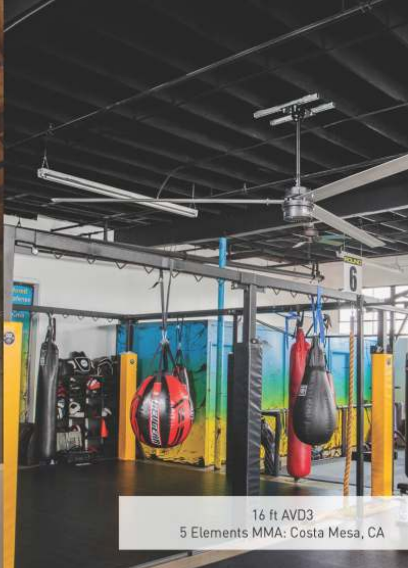
16 ft AVD3 5 Elements MMA: Costa Mesa, CA