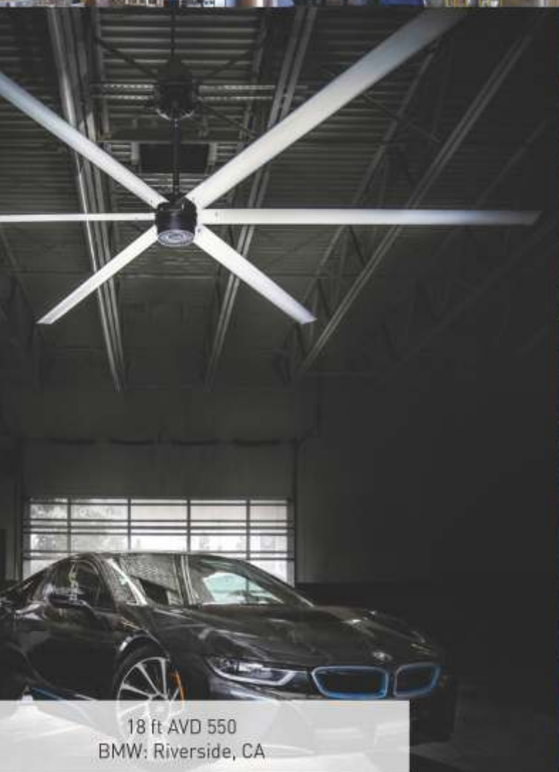
18 ft AVD 550 BMW: Riverside, CA