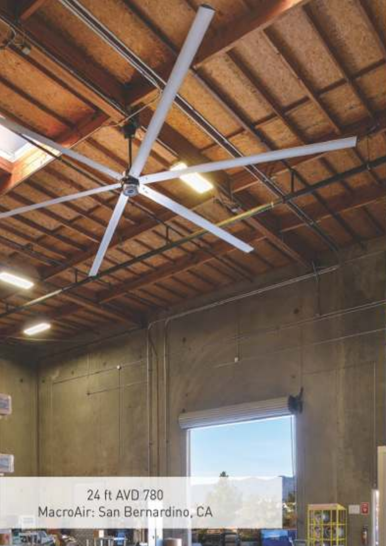
24 ft AVD 780 MacroAir: San Bernardino, CA