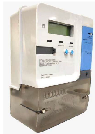
Three Phase (Whole-current and CT-operated)