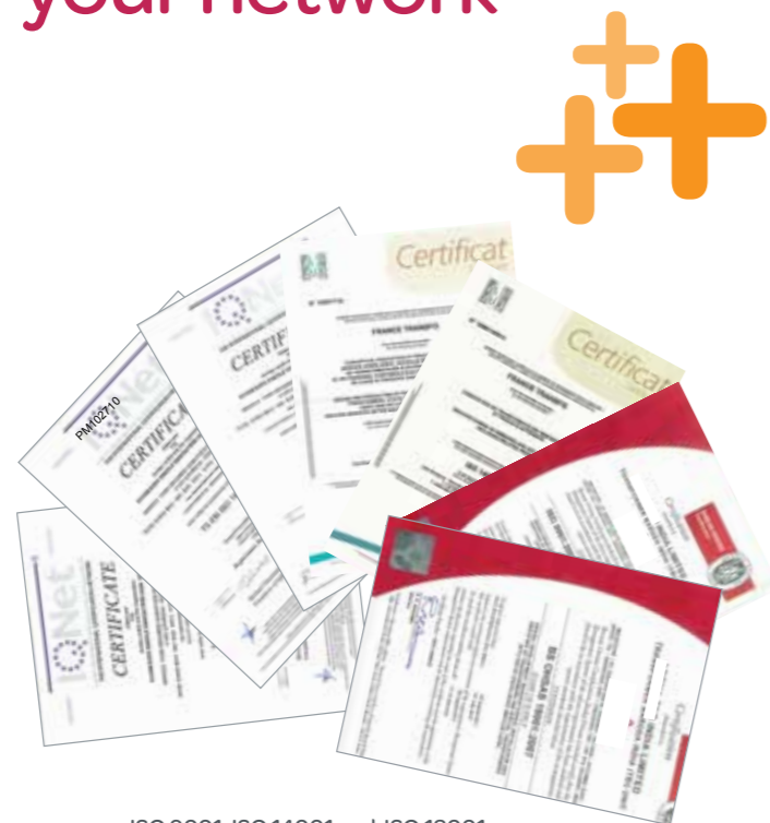
ISO 9001, ISO 14001 and ISO 18001 Transformers units certifications

As customer satisfaction is our main concern, we constantly improve our manufacturing process, thus we are able to speed up delivery time while ensuring that all ISO 9001, ISO 14001 and/or ISO 18001 requirements are met at each production step. To ensure this high level of quality, our Minera MP transformers undergo routine tests in accordance with international standards such as IEC, ANSI standards. We can also provide type tests or special tests on request.